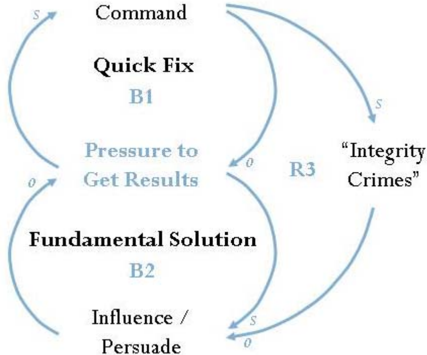
Exhibit 3. A "shifting the burden" causal loop

(s = supporting action, and o = opposite action)